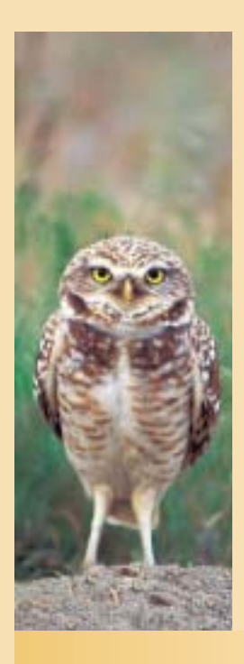
INSIDE: practical ideas and suggestions for making your golf course wildlife-friendly.

Communicate plans ahead of time and educate golfers about wildlife conservation opportunities and initiatives. With a strong outreach plan, you'll enlist plenty of support. After all, getting outdoors and reconnecting with nature are among the top reasons why people play golf.