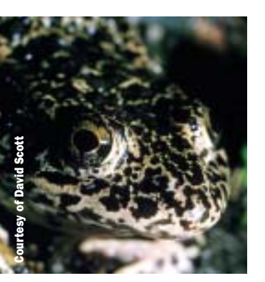
Frogs and toads, including this Carolina gopher frog, are voracious insect predators, making them welcome additions on golf courses.

As wildlife conservation on golf courses has advanced, so has recognition of the importance of maintaining a broad diversity of species. Golf courses designed to attract a wide array of birds, butterflies and other animals can make a day on the links all the more enticing.