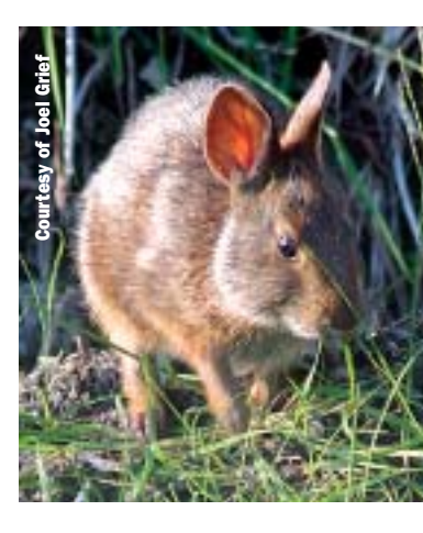
Planning for wildlife requires attention to all creatures great and small. Although small mammals rarely capture the spotlight, their importance in the food chain is vital to sustaining a wide variety of other species.