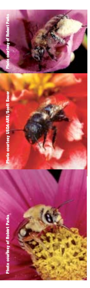
A hole-in-one is all in a day's work for these master pollinators. Above (top), bee with heavy pollen load; (middle) a mason bee and (bottom) eucerine bee probing for nectar.

Next time you breeze down a grocery aisle or stroll by a flowerbed, consider the tiny unsung heroes on which we rely for most fruits and vegetables. Pollinators such as hummingbirds, butterflies and bees ensure that people have food by helping plants reproduce. In fact, about 80 percent of all plant species require the help of pollinators for reproduction. While searching for nectar, a single female bee may visit tens or even hundreds of flowers, actively gathering and depositing pollen along the way.