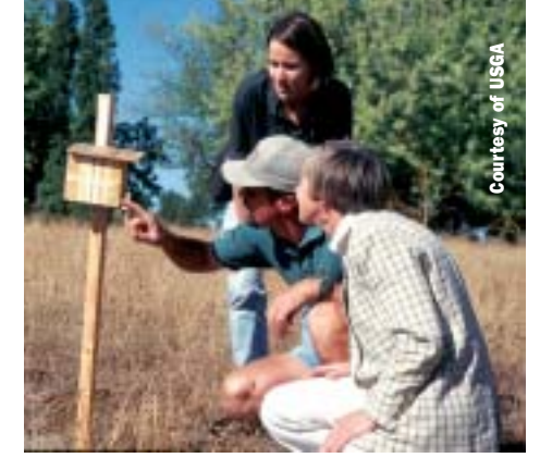
Field investigators check a bee nesting box at Veterans Memorial Golf Course in Walla Walla, WA.

and pollen throughout the growing season. Including both perennials and annuals will cater to a greater diversity of bees active in different seasons – and make the habitat more attractive to golfers.