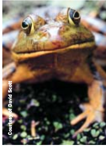
Golf course ponds tend to be dominated by bullfrogs, which are among the few amphibians that can compete with the fish often present in permanent wetlands. However, a healthy ecosystem requires a greater diversity of amphibian species.

Preserving seasonal wetlands in out-of-play areas will increase the diversity of wildlife on a golf course. Many pond-breeding amphibians, such as the Chamberlain dwarf salamander (pictured above), rely on seasonal wetlands for mating and egg-laying.